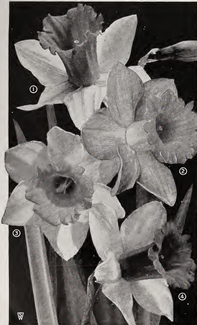
Giant Trumpet Narcissi

Doz. 100 1,000 Jumbo bulbs ..... $1 50 $9 00 $85 00 First-size, round bulbs ..... 1 00 7 00 65 00